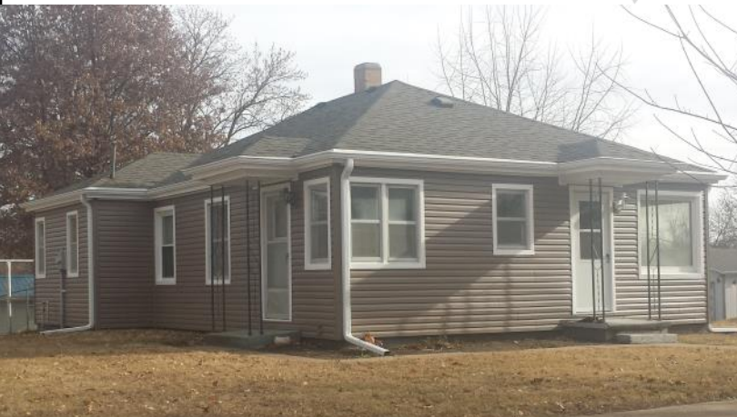
Before and after photos of home rehabilitated in Falls City, Nebraska.

federal grants as well as contractors and subcontractors hired to make home repairs. Information about assistance with completing the SAM registration process is included on page two of this newsletter.