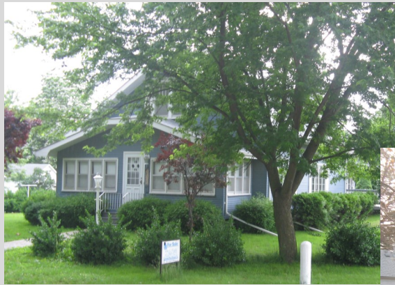
Seward County Home Purchased

HOP programs provide financial assistance to those persons/families of greatest need, improve availability of housing, promote homeownership, increase the attractiveness of underdeveloped neighborhoods and increase local employment.