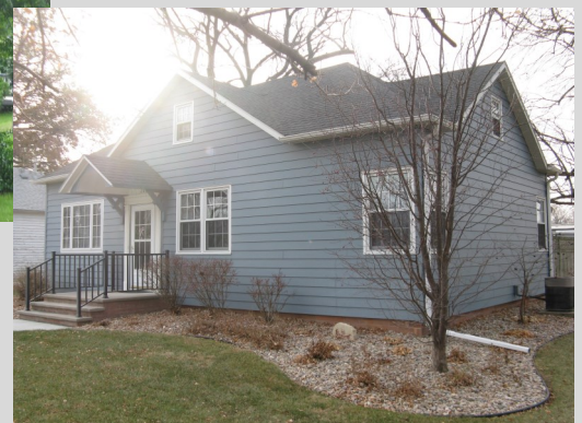
Fillmore County Home Purchased

requirement. All program applicants are encouraged to secure permanent financing from lenders within the County they are purchasing a home in.