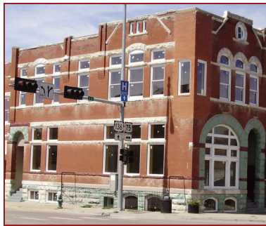
Auburn DTR—Historic Building Project

downtown areas to consider for enhancement. The City is utilizing CDGB funds for grants or grant/loan combination projects that enhance store front facades. Enhancements include replacement of windows, roof repairs, painting, masonry work and signage. These projects are being completed now through the spring of 2013