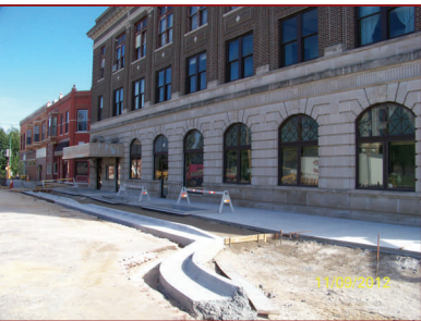
Falls City DTR improvements

Falls City is currently underway with street and sidewalk improvements with CDBG grant funds. They are removing and re-laying a portion of the bricks on two blocks of the downtown square around the courthouse. They will be putting in new sidewalks and gutters along with additional lighting for the downtown area. This project is scheduled for completion by October 31 of this year.